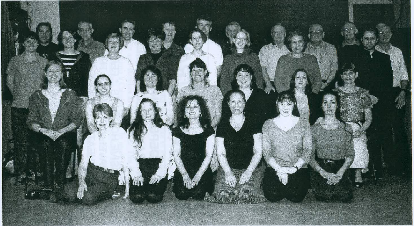
Crowthorne Musical Players, Die Fledermaus , 2002