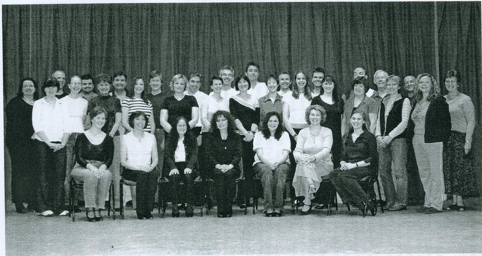
Crowthorne Musical Players, The Boyfriend , 2004